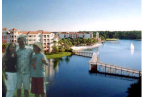
Marriott Grande Vista, Orlando FL

This year, was a year of theme parks, a different kind of vacation than what we are used to, but no less fun. We went East to Orlando, Florida for our vacation. We visited Disney's Epcot Center, all the Disney water parks, and the Universal Studios and generally hang around the greater Orlando area. We became experts using fast pass. One thing we can say about Orlando is that you can set your watch by the time of day the rain starts, yup every day. The thunder and lighting is nothing like we have experienced in California. There is water everywhere in Florida, and we mean everywhere.