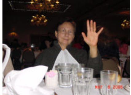
Celebrating Mother's Day with Nanay.