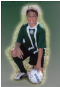
Gerome at the exhibition game in Spartan Stadium during the Earthquake's half time.