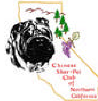
(American Kennel Club Licensed)