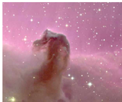
KPNO Horsehead Nebula Image

Technological advances are taking us on a journey further and further into the universe - into the very hearts of stars - to listen to the rhythms of their pulsations, and begin to gain an understanding of the processes by which they evolve. We have discovered that the seemingly peaceful night sky is an illusion. Stars are not eternal - they are born of nuclear fires, they live, and ultimately die. Some stars die quietly, some literally tear themselves apart with violent explosions, while others undergo catastrophic collapse and disappear from the visible universe into extraordinarily dense black holes. We now have begun to understand that we are a part of that cycle, that Earth and life on Earth are connected to the lives of stars in the most profound and fundamental cycle of all - the continuous cycle of stellar birth, evolution, and death...and not only our origins lie within the stars - do does our future.