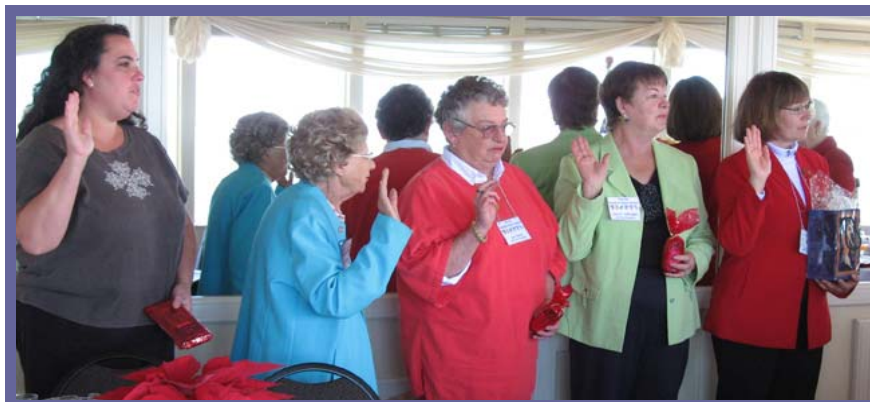
2007 Board of Directors for Estero Bay Republican Women Federated take their Oath of Office.