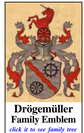
Drögemüller Family Emblem click it to see family tree