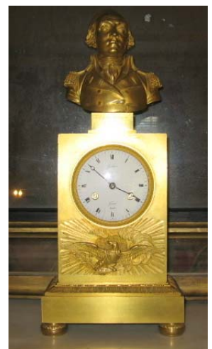
French gilt with bust of George Washington.

This leaves us very close to completing our project. But, it will not be complete until the paperwork is done. The final steps will be continuing research on some of the clocks, completing a write up on the entire project and preparing photos and narrative for submission as a Chapter Restoration Project at the Chattanooga National in June.