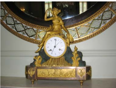
French gilt with Diana, Goddess of the Hunt

The pictured clocks were displayed at the February meeting. They have been since returned to their places in the mansion. There are some adjustments that need to be made to some of the other clocks already repaired. The tall case and one of the French clocks had to be moved by the mansion staff. Both need minor attention. The French Crystal clock (#8) was cleaned and checked by Pete Schreiner and found the movement to be okay but a cracked solder joint and corrosion of the battery terminals kept it from running.