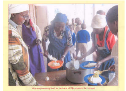
Women preparing food for orphans at Glenview old farmhouse

This program provides the 60 children with both tuition and one meal a day. The meal consists of Sadza, a form of thick porridge made from com meal, and vegetables on Monday and Tuesday. On Wednesday and Thursday they are given Sadza and beans. On Friday rice and soy meat. Some of the orphans walk 10 miles to school on empty stomachs; they walk through unpaved, muddy roads, avoiding dirty water along the way. There are no school buses in Zimbabwe! Paying tuition is impossible for most of the orphans; by the 11th grade most drop out and never graduate from high school.