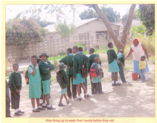
Kids lining up to wash their hands before they eat.

through the new food program; he is going on faith and prayer that they will be able to raise several hundred dollars a week for this effort.