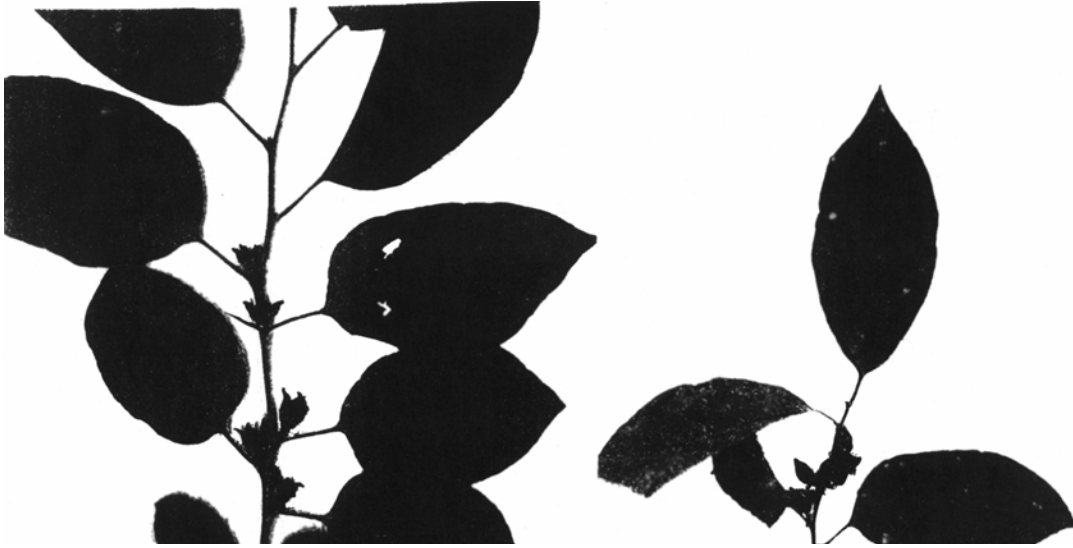
Figure I-1. American persimmon (54% natural size).

The American persimmon flowers later than the Oriental persimmon. The fruit is a berry which is flattened, globose, or