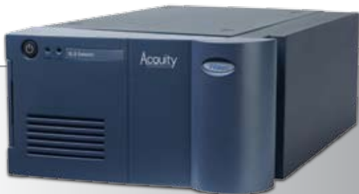
Waters ACQUITY UPLC Evaporative Light Scattering Detector.

The ELS Detector interfaces with the ACQUITY UPLC console for convenient instrument parameter access and control, and has a snap-in self-aligning lamp and nebulizer for optimized performance. It is controlled by Empower or MassLynx software.