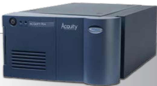
Waters ACQUITY UPLC Photodiode Array Detector.

With data rates up to 80 Hz and noise specifications as low as 10 \mu AU, the ACQUITY UPLC PDA Detector provides unequalled trace impurity detection and quantification using maximum chromatographic sensitivity.