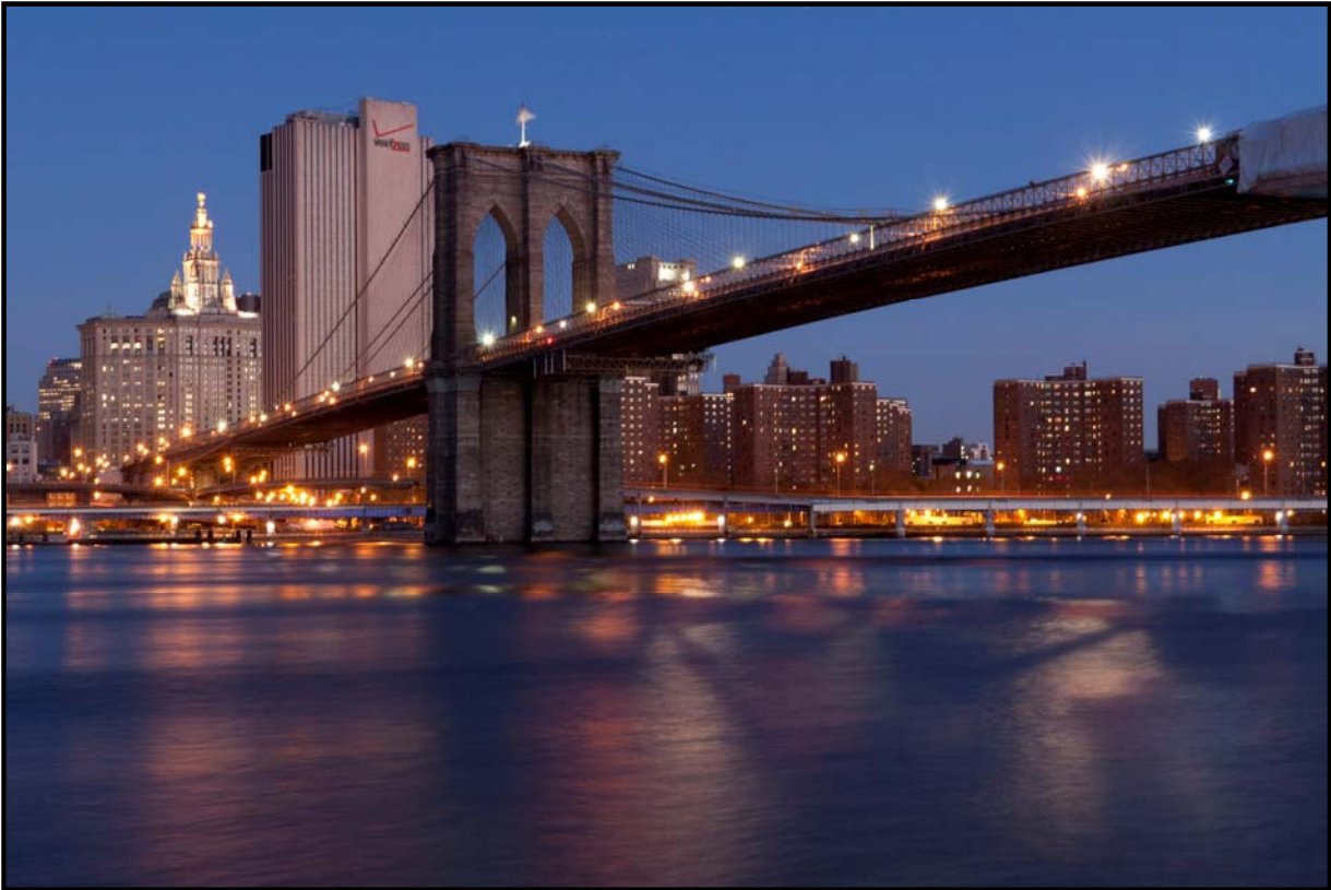
Brooklyn Bridge