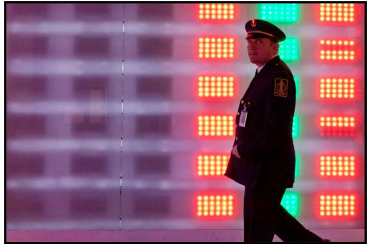
Rockefeller Center Guard

In last year's trip to New York City I found some great scenes. The Guard was on the "Top of The Rock" in the Rockefeller Center. I got a real kick out of the Pig Delivery in Chinatown in lower Manhattan.