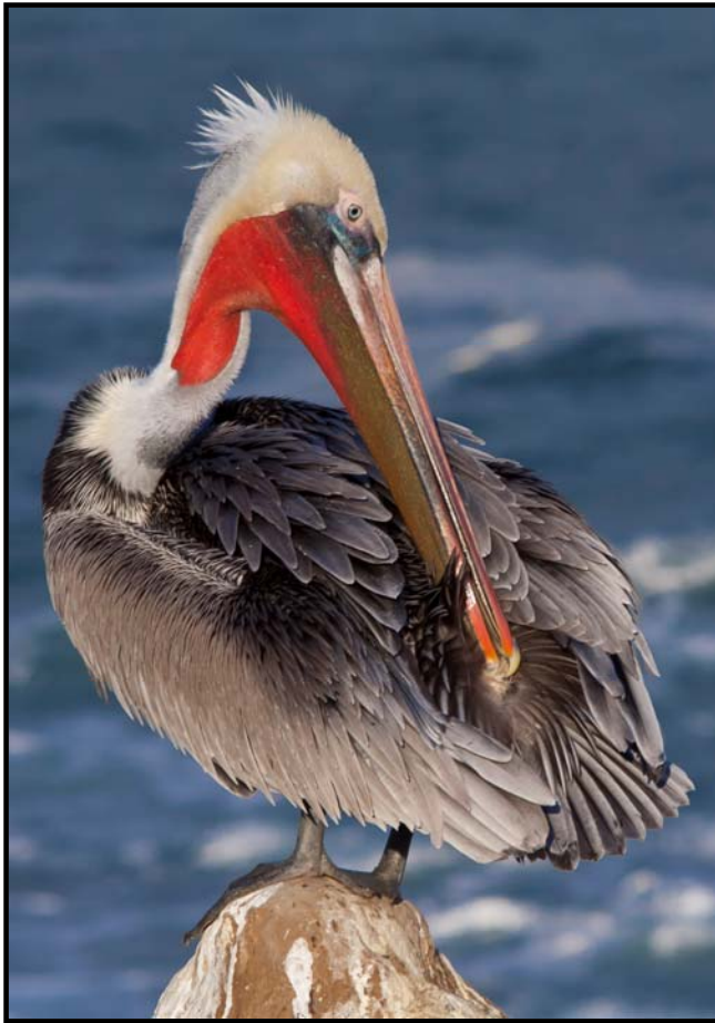
Brown Pelican 2

The Great White Heron was taken on Marco Island in Florida. I felt lucky to get very close to this bird one morning right after sunrise. The images of the Western Brown Pelicans were taken this January near San Diego in California. I love the colorful breeding plumage of the male (left). The Wood Duck was taken in the Santee Lakes Recreation Preserve near San Diego. This is a nice area for water birds and I recommend that birders and bird photographers go there.