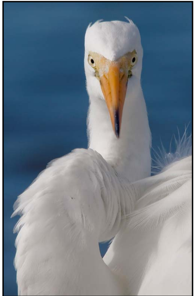
Great White Heron

The Great White Heron was taken on Marco Island in Florida. I felt lucky to get very close to this bird one morning right after sunrise. The images of the Western Brown Pelicans were taken this January near San Diego in California. I love the colorful breeding plumage of the male (left). The Wood Duck was taken in the Santee Lakes Recreation Preserve near San Diego. This is a nice area for water birds and I recommend that birders and bird photographers go there.