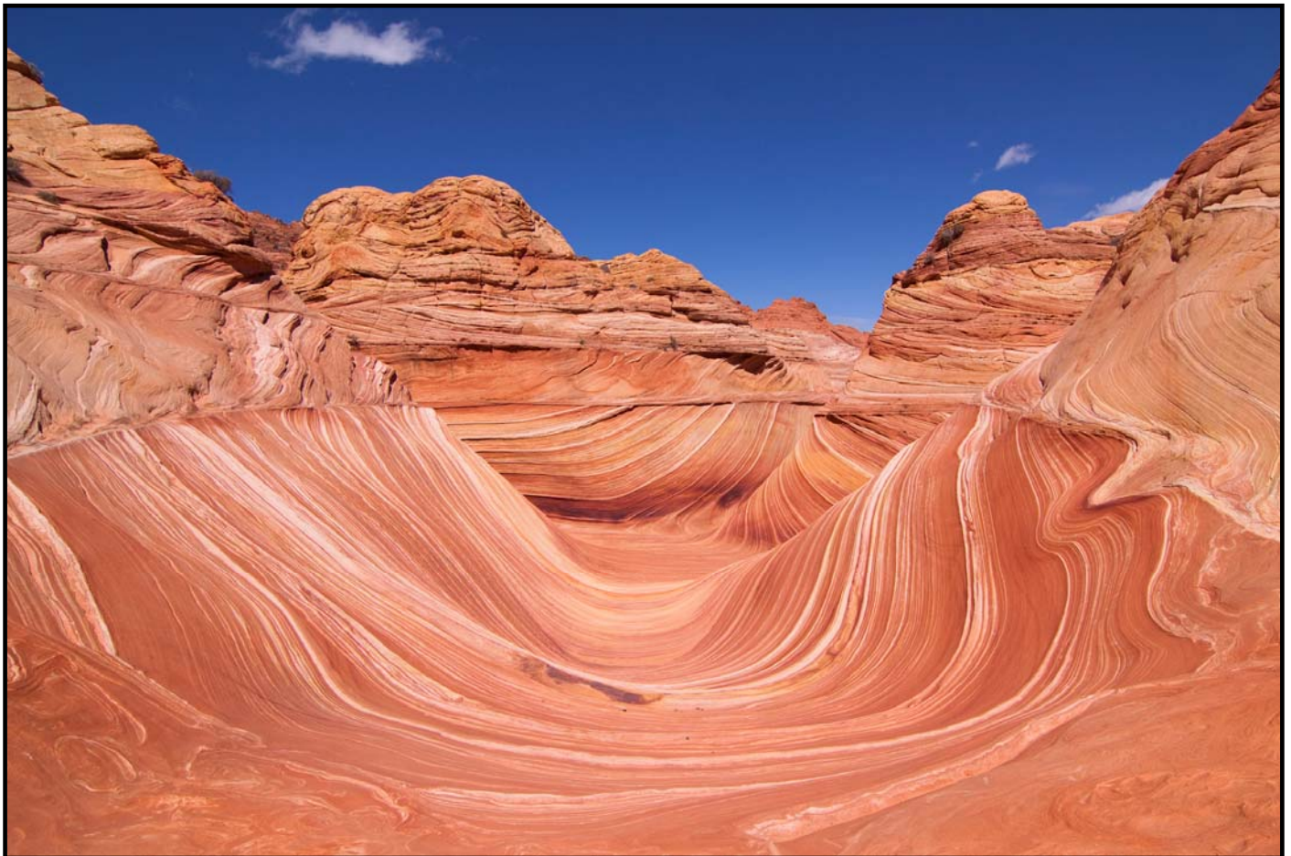
The Wave

Finally I am also the family's official pet photographer. Lucy, on page 12 , is a great subject.