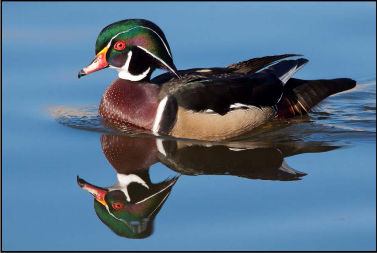
Wood Duck © DIETMAR HAENCHEN