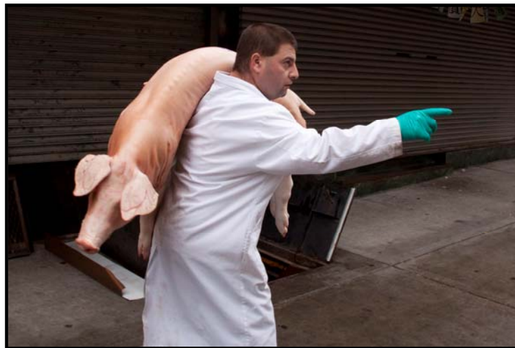
Pig Delivery