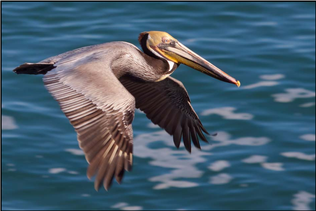
Brown Pelican