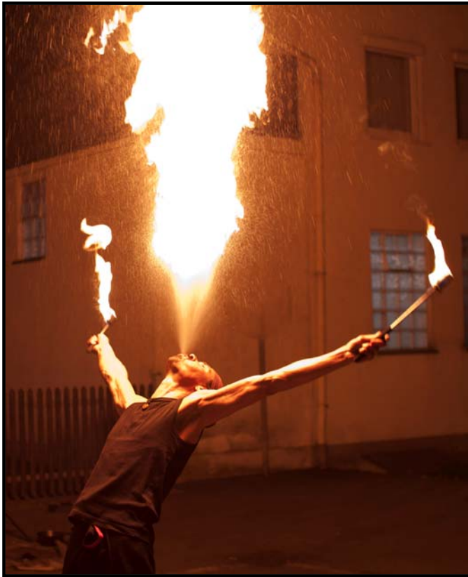
Fire Eater

Travel photography is one of those things I like best. The Fire Eater was actually performing at one of my friend's birthday party in Germany last year. We found the Snake Charmer during the WCC student trip with Terry Abrams to Morocco.