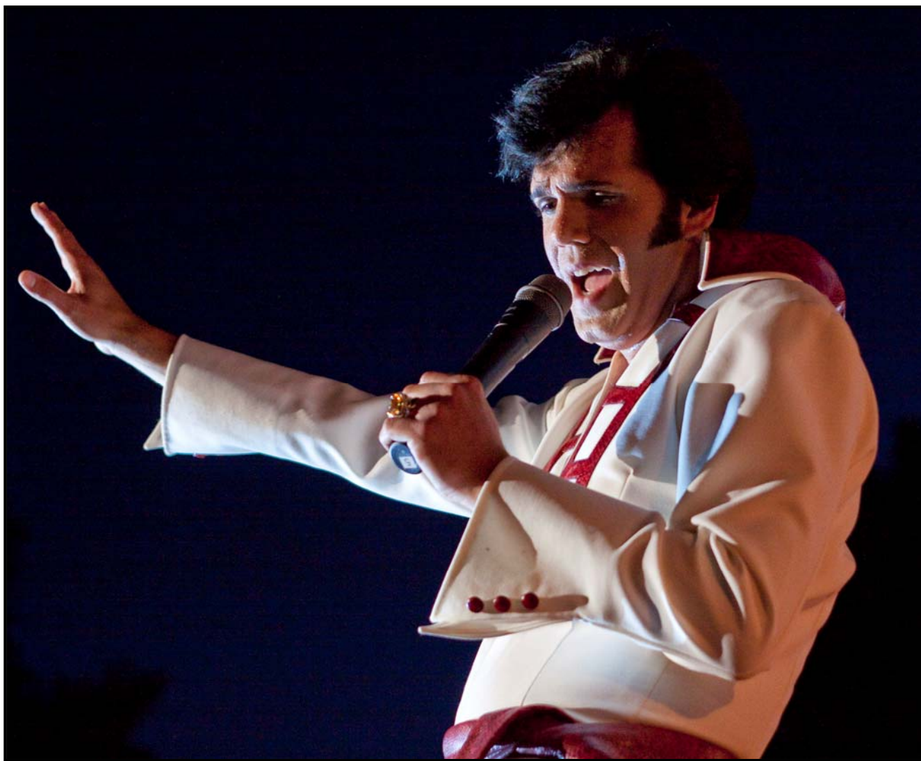
Elvis Fest

I take photographs at all kinds of events and I found the Elvis impersonator at the Ypsilanti Elvis festival in 2009. This was a fun event and also offered nice photography opportunities.