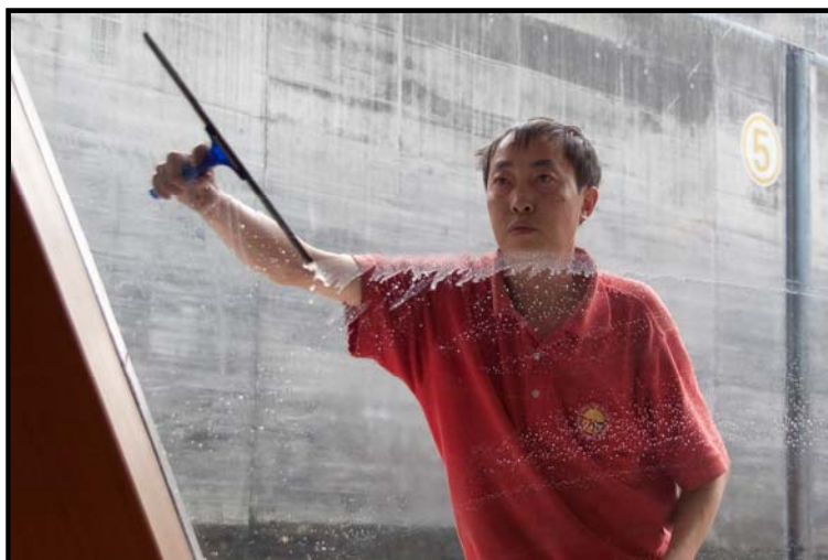
Window Washer

On pages 10 and 11: The Brooklyn Bridge was taken before sunrise and the Empire State Building after sunset.