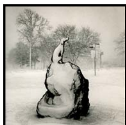
Snow Dog

A cash bar with hors d'oeuvres will be open at 6 pm. Dinner will be served at 7 pm. The cost is $38.00 per person. Please mail your check to AACC P.O.Box 131031 Ann Arbor, MI 48113 or bring it to Brad Bates at a club meeting on March 1st or 15th. Please consider including your 2011 dues ($25.00) in your check.