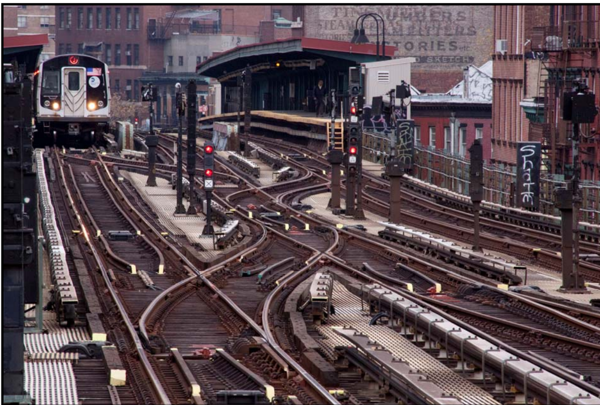
Marcy Avenue Station, Brooklyn