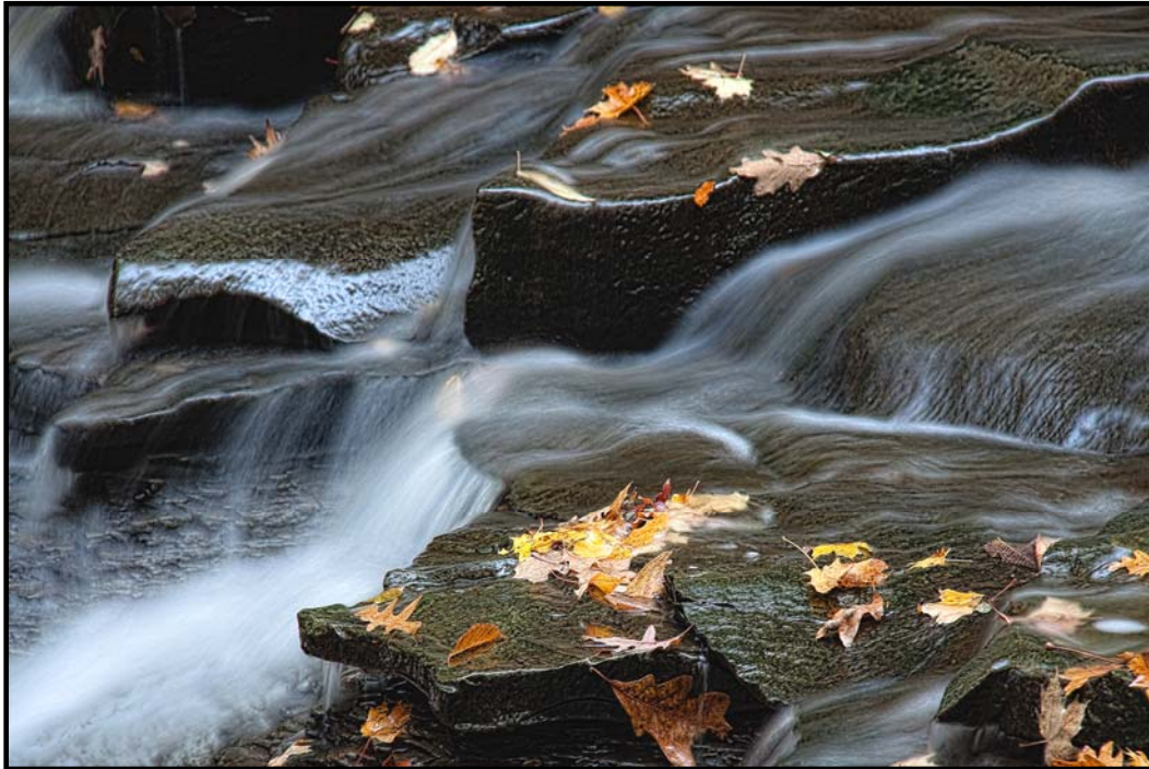
Cuyahoga Valley, N P, Ohio

Cuyahoga Valley, N P, Ohio: 1 st Place Winner, Projected Image, Assignment, Advanced