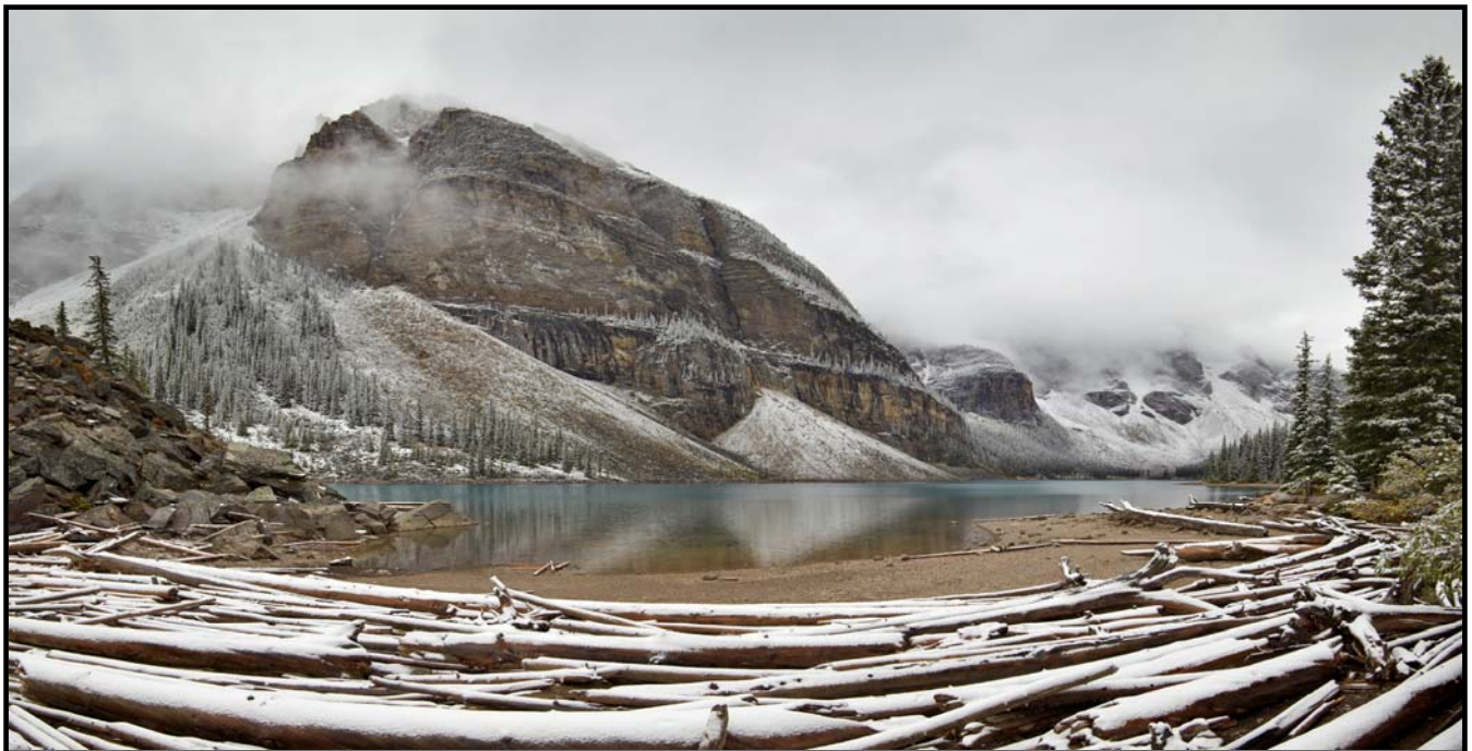
First Snow

Lago d Misurina: 3 rd Place Winner, Projected Image, Assignment, Advanced