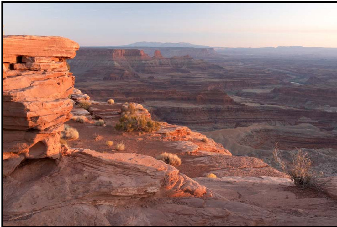
Etched Sunset, © GREG CZARNECKI

Cuyahoga Valley, N P, Ohio: 1 st Place Winner, Projected Image, Assignment, Advanced