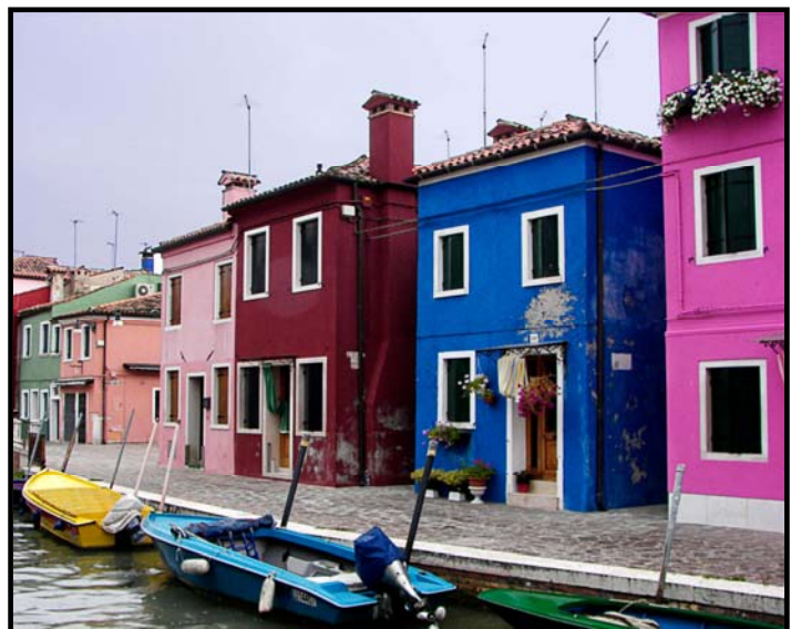
Burano Canal