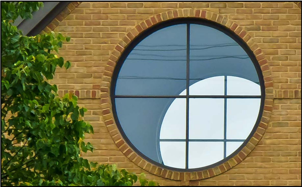
Dueling Circles

Silver Shadows : Third Place Winner, Projected Image, Open, Advanced