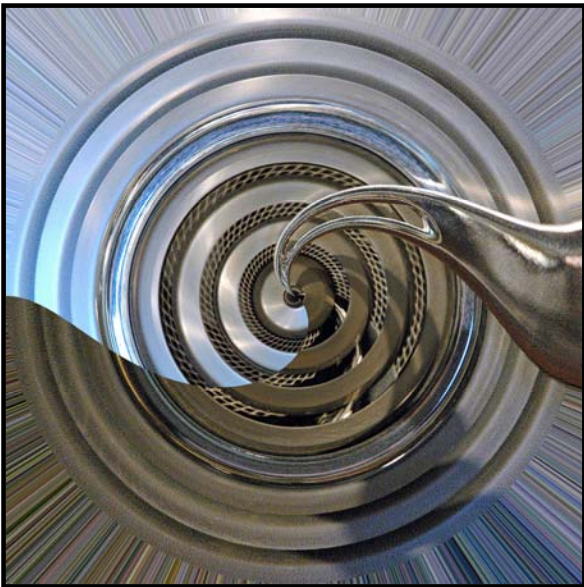
Silver Shadows , © TERRY TOMPKINS

Yin/Yang Water : Honorable Mention, Print, Assignment, Gallery