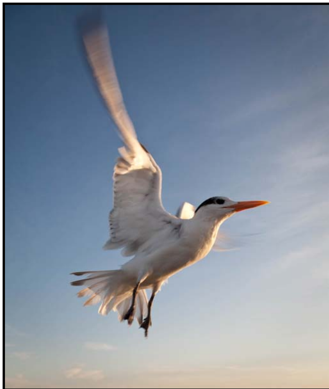
Escaping Gull: Honorable Mention, Print, Open, Advanced