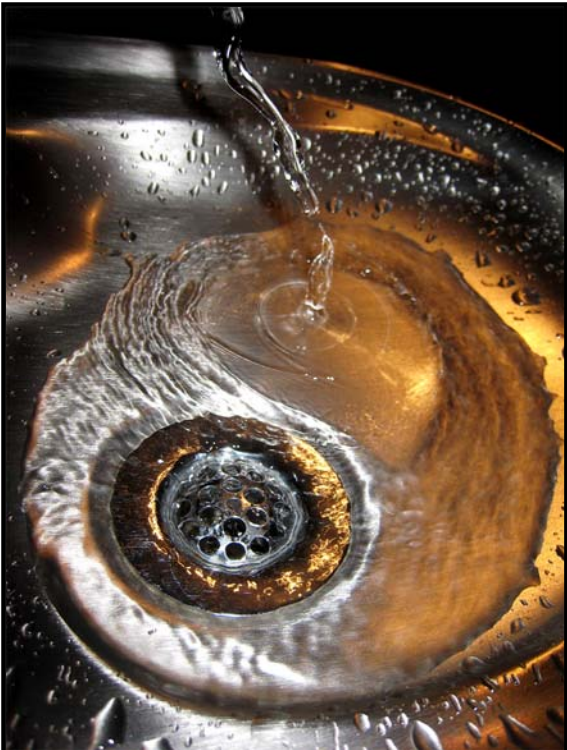
Yin/Yang Water , © SUM HWA KIM

Yin/Yang Water : Honorable Mention, Print, Assignment, Gallery