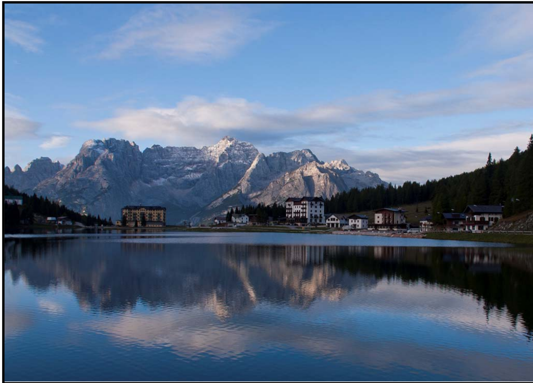
Lago d Misurina

Lago d Misurina: 3 rd Place Winner, Projected Image, Assignment, Advanced