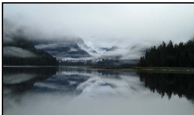
Khuzymateen Valley

Khuzymateen Valley: Honorable Mention, Projected Image, Assignment, Advanced