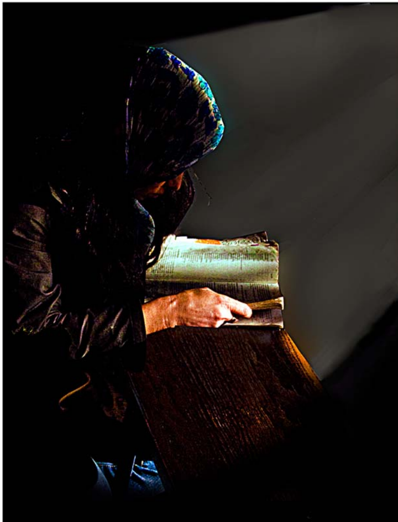
Woman at Prayer

Woman at Prayer 1 st Place Winner, Print, Open, Advanced