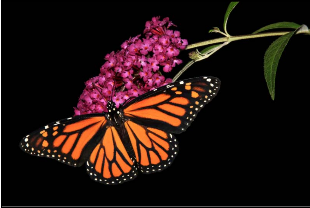
Monarch on Butterfly Bush

Monarch on Butterfly Bush : Honorable Mention, Projected Image, Open, Advanced