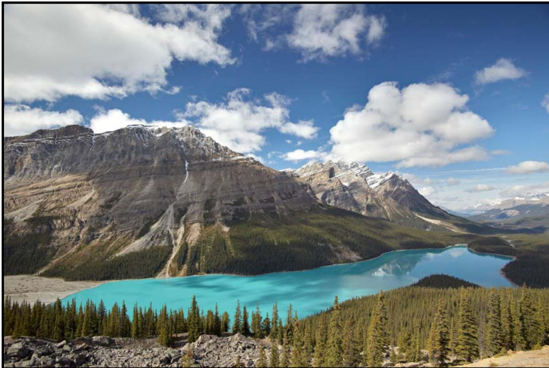
Peyto Lake

Bear Lake : 2 nd Place Winner, Print, Open, Gallery