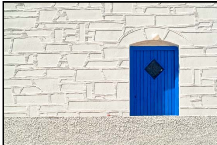
Paros Lefkis Village