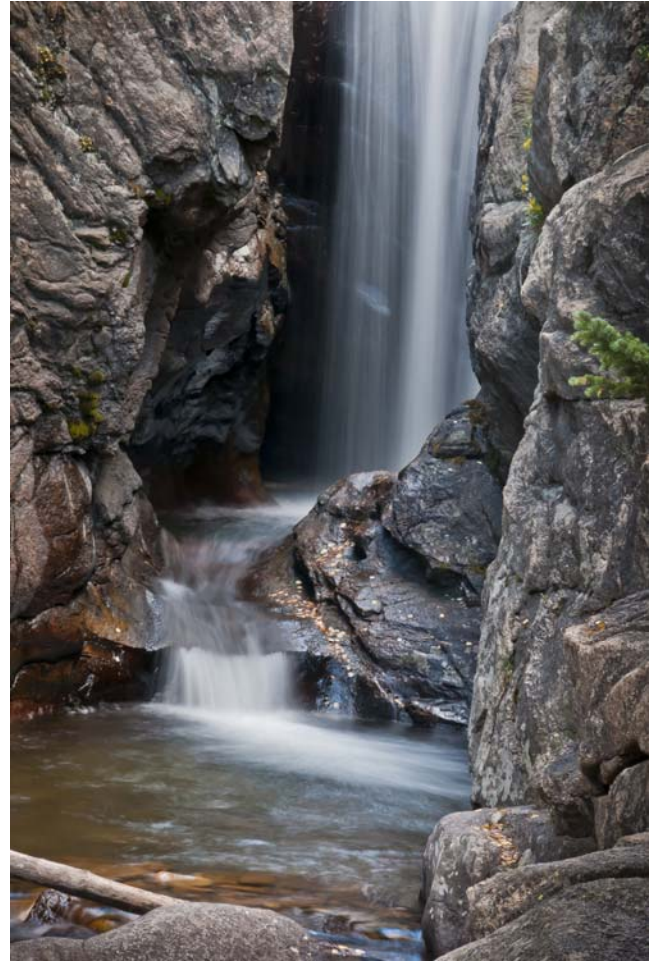
Chasm Falls