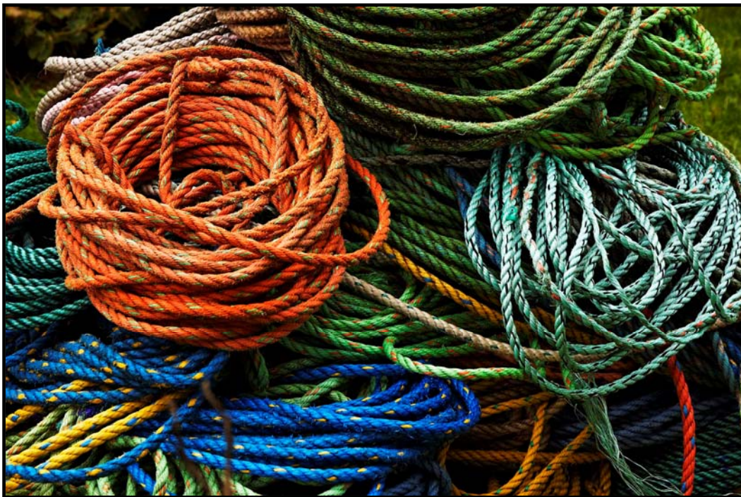
Colored Lines . © BOB PAUP

Monarch on Butterfly Bush : Honorable Mention, Projected Image, Open, Advanced