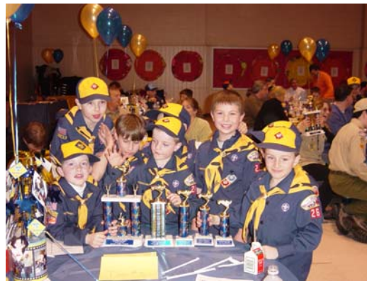
Above Tigers having fun at the B&G.