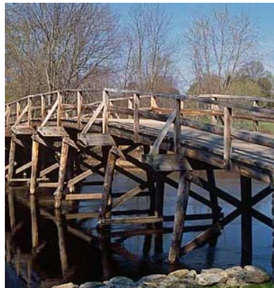
Old North Bridge, Concord MA