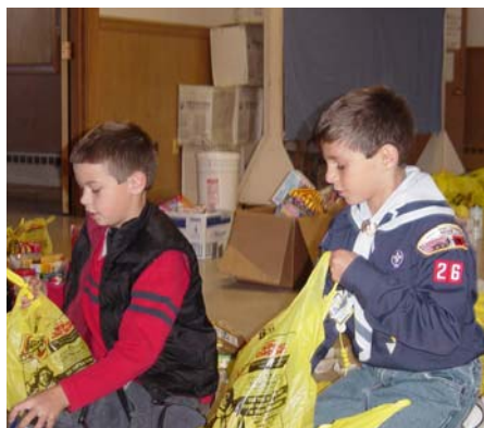
Pack 26 Cub Scouts Organized Food at Pilgrim Church

The Scouting for Food Drive was a huge success! Together the Boy and Girl Scout youths collected over 5000 (2 1/2 tons) of food for local food pantries. Southborough helped the Knox trail Council exceed it's 50 ton goal by 10 tons. I would like to thank all who participated in the food drive. This is a busy time of year for all. All boys who participated in the food drive will be eligible to earn this year's Pack 26 Service Patch. The patch will be awarded in the Spring!