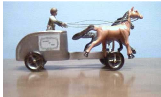
Chariots of Fire

Race Day – Saturday, January 25, 9 - 12AM