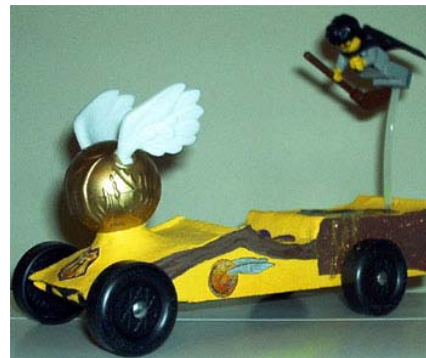
Harry Potter Special

derby cars! The Pinewood Derby race is less than three weeks away. Think out of the box!!! Design a car with some pizzazz!