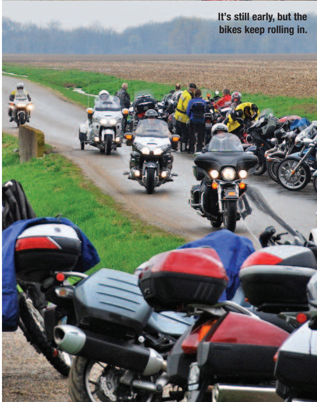
It's still early, but the bikes keep rolling in.