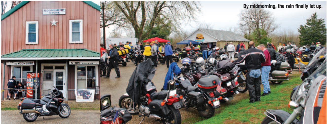
By midmorning, the rain finally let up.